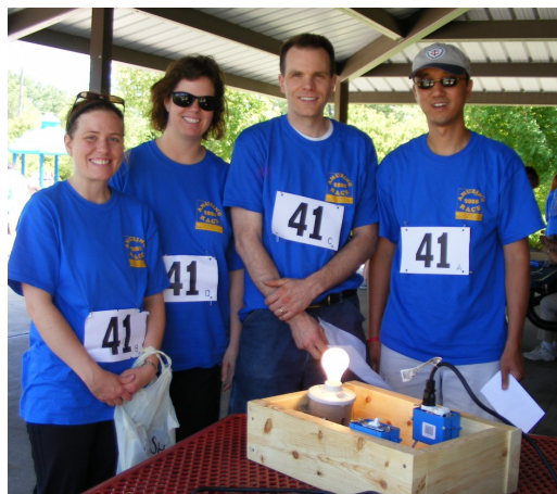
Clue # 16 - Wire up a light socket and switch.