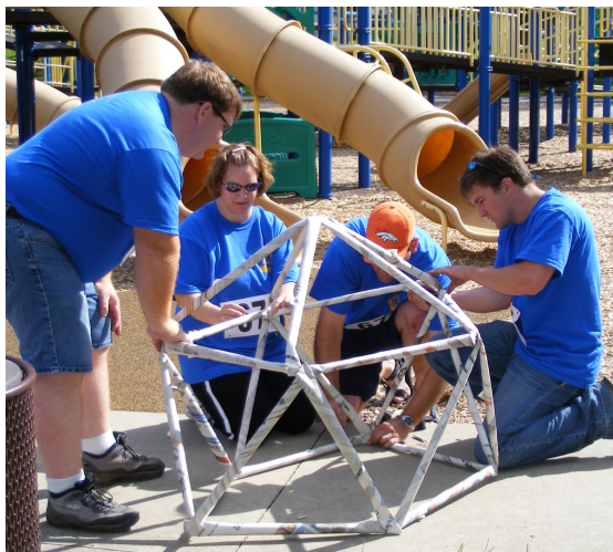
Below: Clue # 4 - Create a geodesic dome out of newspapers.

During the course of the race, teams were sent all over Rochester to find their clues and perform tasks. Some tasks included building a geodesic dome out of newspapers, stacking paper cups into a pyramid without actually touching the cups with their hands, finding a certain employee at Target North, finding two cards with their team number on them out of a mountain of old library catalog cards, an electrical wiring project to turn on a light bulb, etc.... The race ended at the Sports Center Fieldhouse at Rochester Community and Technical College with an awards ceremony and a picnic lunch sponsored by John Hardy's Bar-B-Q.