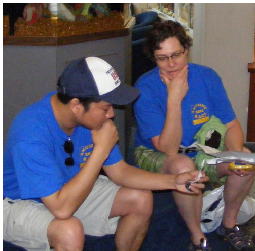
Above: Clue #1 - Trying to figure out the combination lock.

If you were given a combination padlock and a list of three United States Presidents, would you know how to open the padlock? This was the first task to kick off the Rochester Public Library Foundation's Second Annual Amazing Race fundraiser. The first team opened their lock in under a minute. Out of the thirty-five teams participating in the race this year, only eight teams succeeded in opening the lock before the teams were allowed to use library resources to help them. For 15 minutes teams wracked their brains and spun the dials on their locks until the announcement came that they could use any library resource to help them figure out the clue. There was a mad dash to the catalog computers to look up books about presidents and in no time at all, the rest of the teams opened their locks and were on their way to the next destination. For those who are curious, the team that won first place was not one of the eight teams that solved the task within the first 15 minutes.