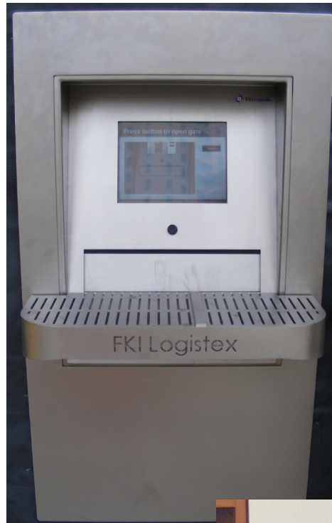
Top: The outdoor bookdrop

The Public Service desk also has a new look this spring. The new desk configuration offers a friendly and more inviting first impression as one enters the library and will be more comfortable and efficient than the old desk for both patrons and staff. The desk features defined work stations, lower counter space, and displays for material. Also the new desk literally brings staff and patrons closer as it's 6 inches thinner.