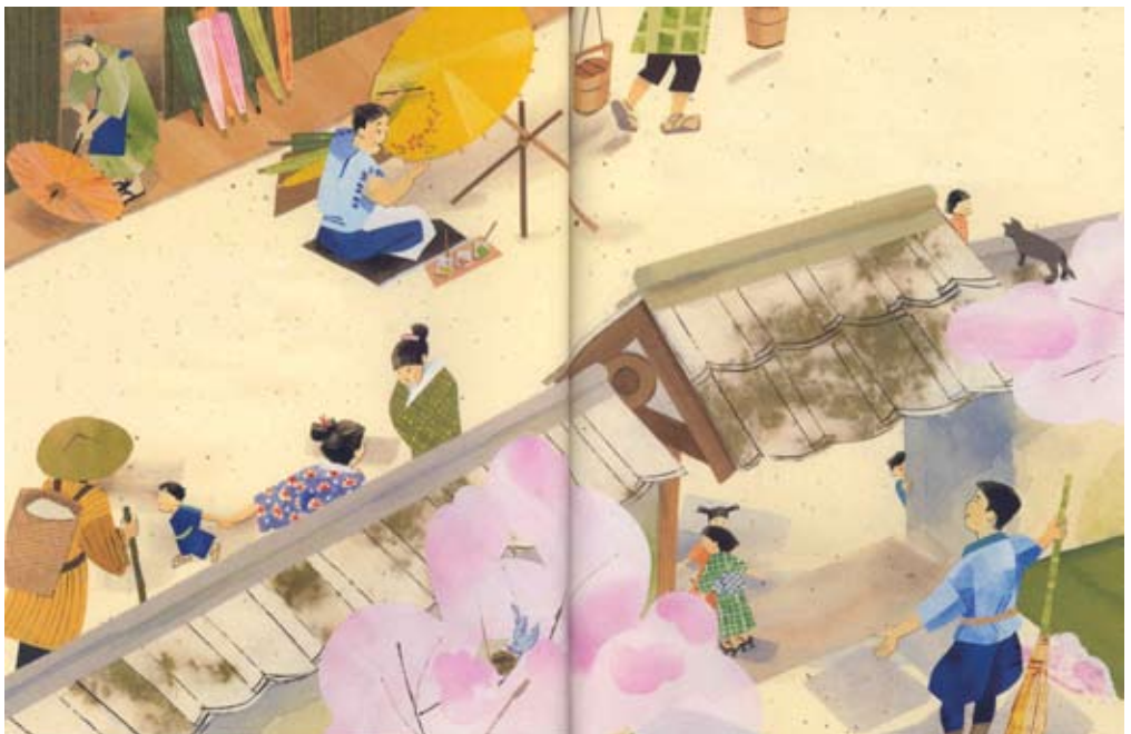
Illustration from Sky Sweeper