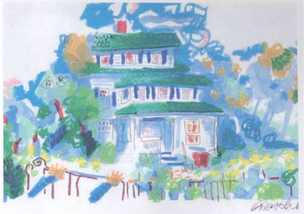
Illustration from The Hello, Goodbye Window