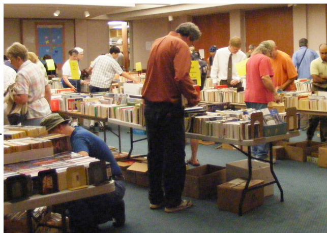
Photo from last year's Rochesterfest booksale.

We are often asked what happens to donated items. Briefly, the following are some of the highlights. Every year we add to or replace materials in our collection directly from your donations. Since 2003, we have added 36,000 items valued at $850,000 to our collection from your donated materials. Our Friends group also sells items that are special or unusual online or at specific sales, and the group has a text book and condensed book fund-raising recycling program. Of course our Friends' bookstore does a roaring trade selling your donations and library discards. Last year it raised $45,000 for the library's gift fund, which we use to purchase new materials for the collection. Books are also shared within our community; for example, we give books to Channel One and the Federal Medical Center. On a wider basis, we send books to the troops overseas and to other libraries facing difficulties. Then of course there are the book-sales, thousands of books to browse through and a bargain every time, and proceeds raised go to support library programs and events, a win-win situation for all of us—which brings us back to Rochesterfest. We hope you will join us!