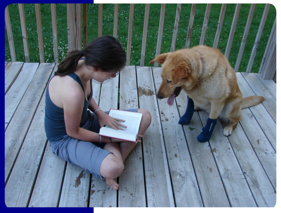
Zeke says, "Keep reading Silvertongue, I want Gwin to come out of the book to play with me."

See their blog for official contest rules.