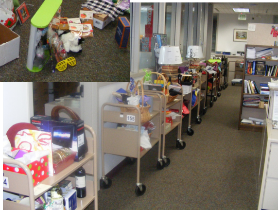
Right: A train of carts loaded with silent auction items waiting to get put on display for the big event.