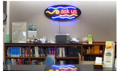
The second-floor reference desk