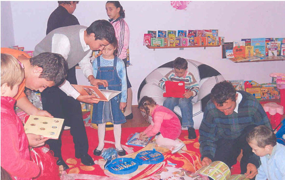
The Learning Room in Arad Gai, Romania.

A thank you letter was read and discussed at a recent Friends of the Library Board meeting referencing 214 children's books that were donated by the Friends to a Learning Room in Arad Gai, Romania. The mystery lover in me had to learn more.