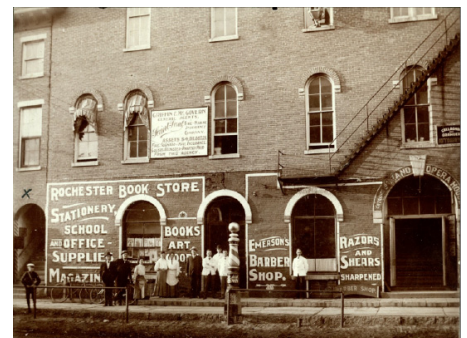
Ireland's Bookstore - 1866.