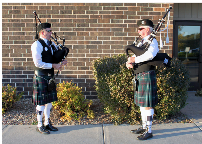
Pipers greeted the attendees as they arrived.

The Rochester Public Library is grateful to everyone who made this event possible: Glenfiddich Distillery, Andy's Liquor, Canadian Honker Event Center. Silent Auction