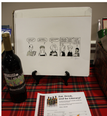
An Unshelved comic strip poking fun at some of the reasons people come up with to ban a book.

books during Banned Books Week we are not necessarily endorsing specific titles, but we are working to raise awareness that censorship exists in America and within our community.