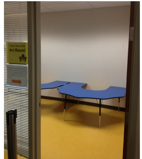
The new art room located near the entrance to the Children's Area is getting ready for the big Open House on September 6.