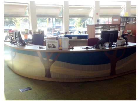
The new desk with trees and blue sky continues the nature theme in the Children's area.