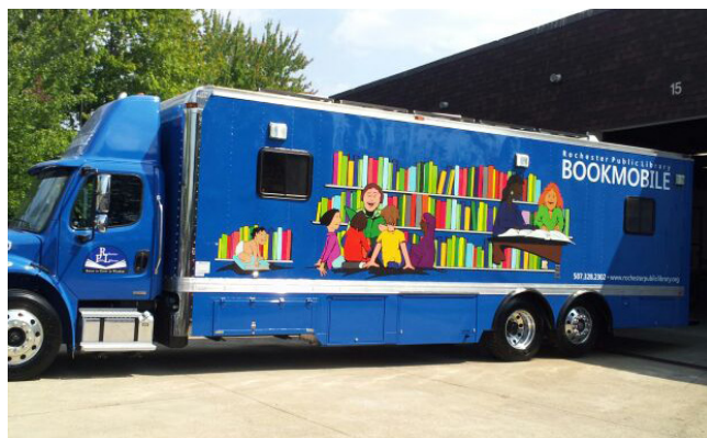
The library's fourth bookmobile purchased in 2012