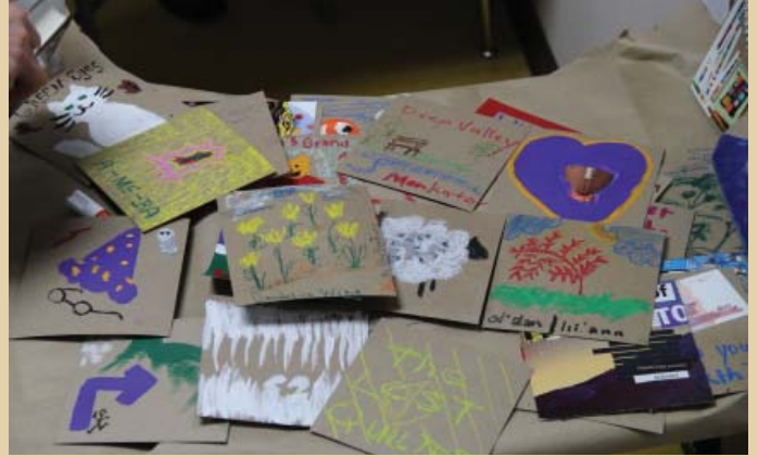
Attendees were invited to create an square for a collage that will be displayed in the library (top). The complete individual projects (below).