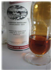
The Pipes will be heard!

Register online: www.rochesterpubliclibraryfoundation.org or by calling 507.328.2343