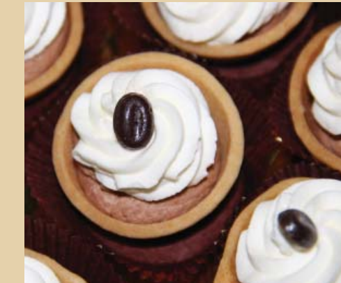
Just a few of the tasty delectables from this year's Wit, Wisdom and Wine.