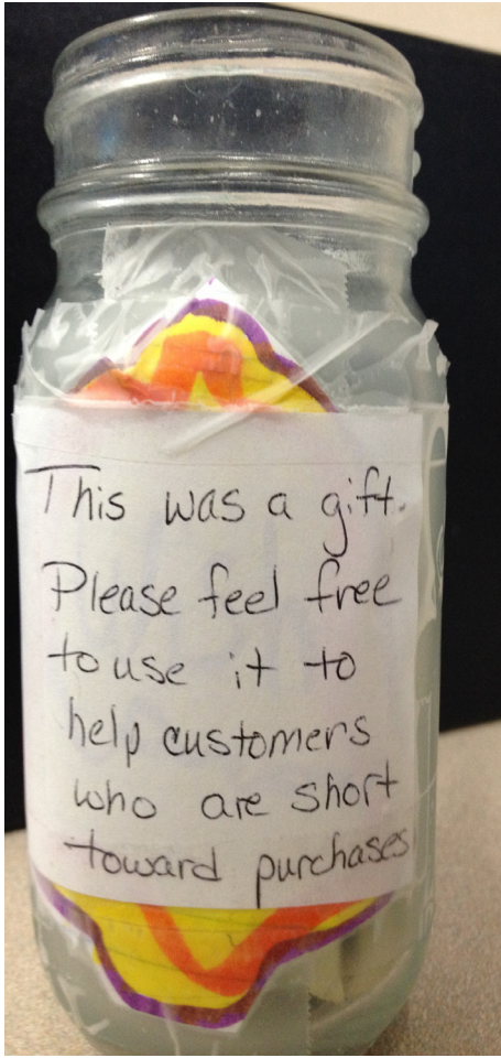
Top: The jar left at the Friend's of the Library bookstore with almost $10.

I've overheard a few other volunteers talking. I think they plan to carry on the tradition, too. Good multiplies and it touches us all, changing each of our lives, one at a time, for the better.