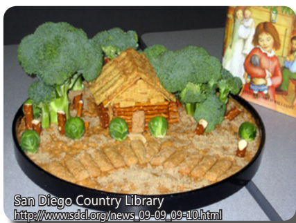
San Diego Country Library http://www.sdccl.org/news_09-09_09-10.html

Saturday, March 30, 2013 Library Auditorium