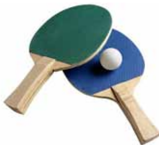
Table Tennis Demonstration, Auditorium, 1PM

Allegro School of Dance & Music presents a preview of their upcoming holiday production Marushka and The Four Seasons . Soloists will tell an excerpt from this beautiful Russian fairy tale through dance and narration. Other information: Auditorium seating is limited to 170 people.