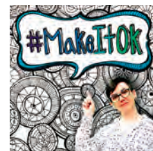
Mind Matters Page 3