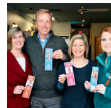
Books and Brews Page 6