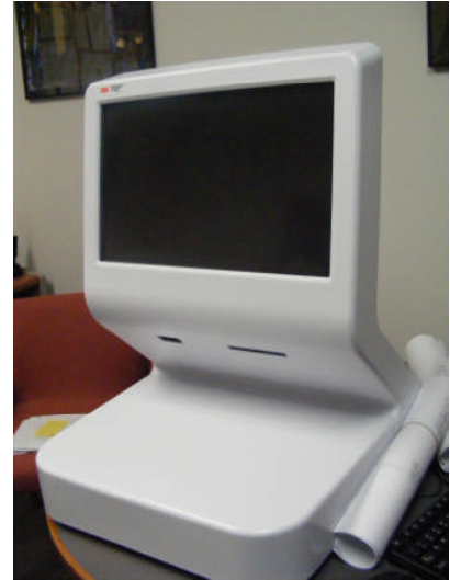
New Self-Check Machine

All the changes are being made to serve the community better. None of this would have happened without your generosity!