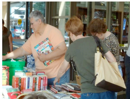
Shoppers sift through the vast selection of books.