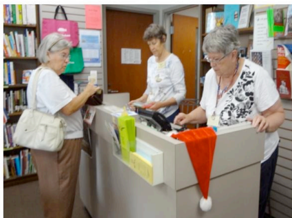
Manning the register during the sale.