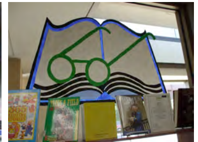
Glocke's window paintings as displayed in the Friends' Bookstore