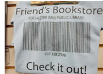
New T-Shirts in the bookstore