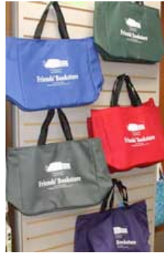
New tote bags available

The book store also offers gift certificates, t-shirts, and tote bags for sale if you need a gift (even if it is for yourself!).