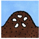
Seeds to Hill: 6-8 Seeds