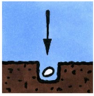
Direct Seed: 1" Deep