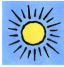
Light: Full Sun

Plant outside after danger of frost has passed, and soil is warm.