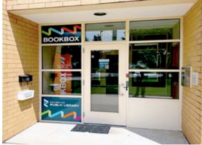
"A Look Inside the Bookbox" continued from page 1.

If you've been to the second floor of the library recently, you might have noticed some major changes! The temporary wall has come down on the west side of the building, a new community corner has been constructed to house all our local community materials, the Seed Library has moved, and we've upgraded our microfilm machines. There are even some empty table space set aside for a future project that you have all been asking to return – the Convert-O-Lab! Be sure to swing up to the second floor the next time you are in the library to check out these new spaces and enjoy our upgrades, as we continue to transform our second floor space! If you'd like to be added to the Convert-o-Lab email notification list when this service is re-launched, please send an email to reference@rplmn.org