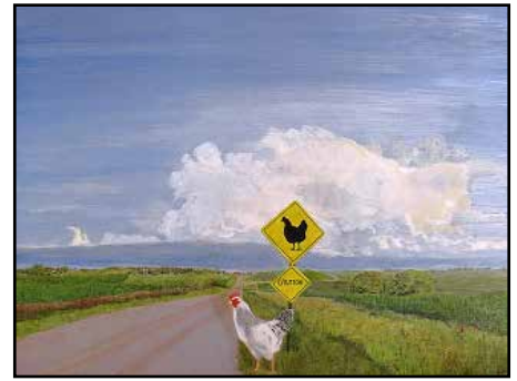
"Will the Chicken Cross the Road?" ©Rita LeDuc, 2015 Original Oil Painting 20"x16", Hardboard

Libraries across Southeastern Minnesota, and particularly RPL, have added countless hours of interest and enjoyment to our lives and opened our eyes to many new opportunities. We are very grateful.