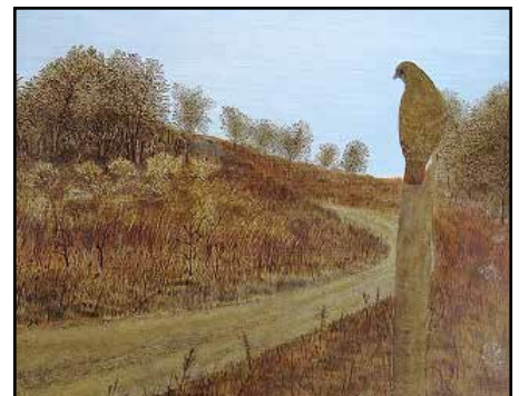
"Take Me Home" ©Paul LeDuc, 2015 Original Oil Painting 20"x16", Hardboard

Making decisions and taking risks is a part of everyday life that one cannot escape. Even with the help of guideposts, there are no guarantees that one's choices will yield the results desired in that split second of mindfulness. In farm country, an open road may beckon a chicken, but 'Will the Chicken Cross the Road?' and still remain a chicken?