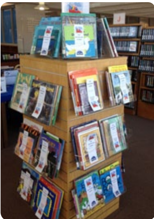
Book bundles can be found in the Children's Area.