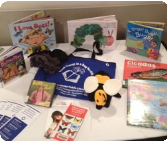
A mini storytime kit "All about Bugs!"

As we were exchanging the check, I asked them why they chose the library this year. "I love to come to the library", "I read books all the time", and "I'm a real bookworm". Perfect answers.