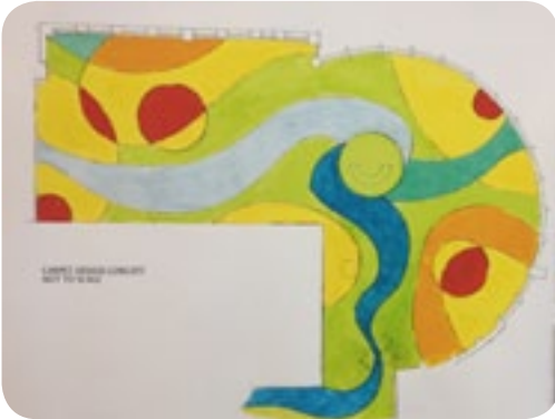
Concept drawings - Above: The carpet design. Below: the new entrance to the Children's area