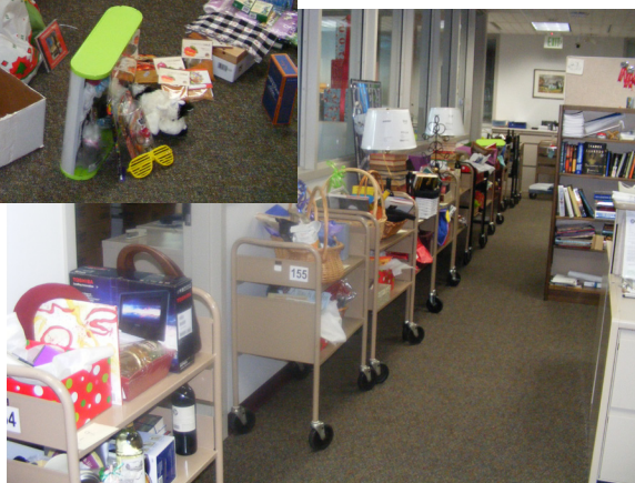
Right: A train of carts loaded with silent auction items waiting to get put on display for the big event.